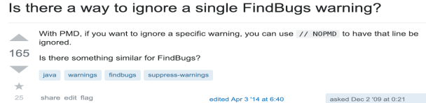
Fig. 2. The most viewed SO post regarding SAT alerts

1) Ignore/Filter alerts : Developers may want to ignore an alert irrespective of false positives or not. Developers may also want to filter the alerts based on alert type, code location (files, methods, data type etc.), or priority. We find that how to ignore/filter alerts in the SATs is the most discussed issue on SO (67 posts, 23.9%). For example, the most viewed post with the highest score and favorite votes in our dataset is a question on how to ignore a single warning in FindBugs as shown in Figure 2.