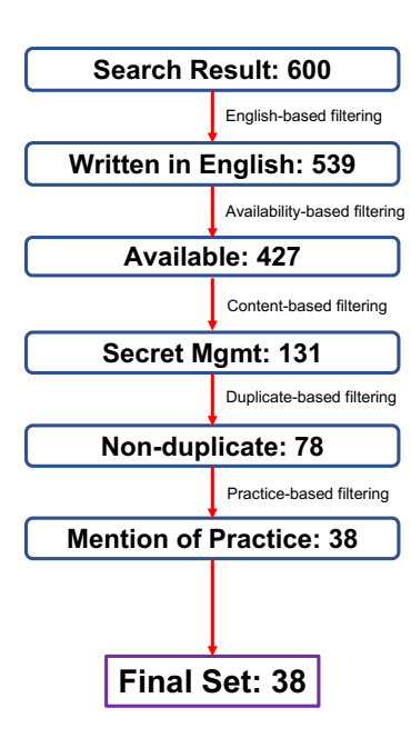
Fig. 4: Application of our inclusion criteria to collect our set of 38 Internet artifacts that we use in our paper.

the problems with readability, practitioners advocate to store secrets that are used by few Puppet scripts at the top of the hierarchy, whereas the secrets used by many Puppet scripts should be stored at the bottom. In this manner, readability can be achieved as the practitioner will know the secrets that are used by many Puppet scripts are available at the bottom of the Hiera data hierarchy, whereas the secrets listed at the top of the hierarchy have limited use cases. We provide an example in Figure 5 that demonstrates how secrets shared across a few scripts can be placed at the top level (line#2-3), whereas secrets used by all Puppet scripts can be placed at the bottom level (line#11-12).